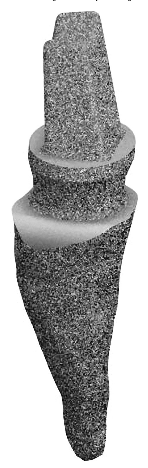
Fig. 2. The STL file of the custom-made RAI.

A novel root analogue dental implant using CT scan and CAD/CAM: selective laser melting technology