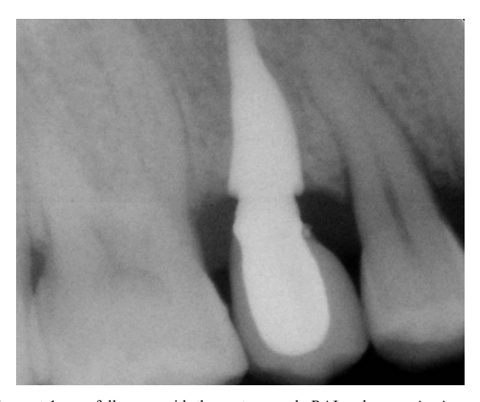
Fig. 4. X-ray at 1-year follow-up with the custom-made RAI and crown in situ.

shortened treatment times, with such developments as immediate implant placement<sup>2</sup>. Primary stability is of paramount importance with immediate implantation. and a good fit between the implant and the host bed is an important factor for implant success<sup>2</sup>. For this reason, it could be an advantage to design a dental implant according and congruent to the individual extraction socket. Hodosh et al.1 were the first to use a custom-made RAI placed into the extraction socket, reducing bone and soft tissue trauma. The polymethacrylate tooth-analogue was encapsulated by soft tissue rather than osseointegrated<sup>1</sup>. Animal studies with root-identical titanium implants yielded extremely favourable results with clear evidence of osseointegration<sup>4</sup>. In several instances implant insertion led to fractures of the thin buccal wall of the alveolar bone<sup>3,4</sup>. A subsequent clinical study revealed excellent primary